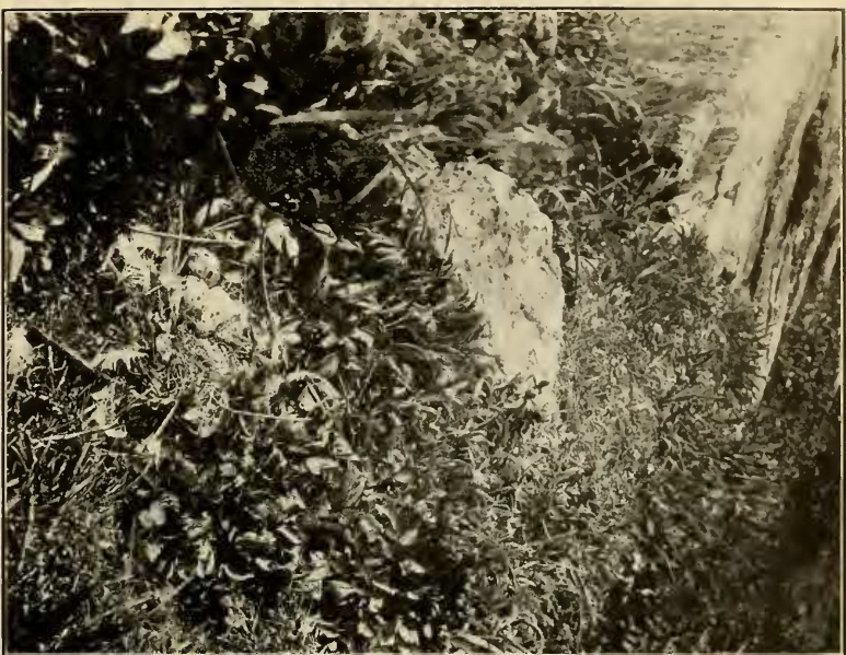
1. RING-BILLED GULL'S NEST AND EGGS, SEAL- NET POINT.